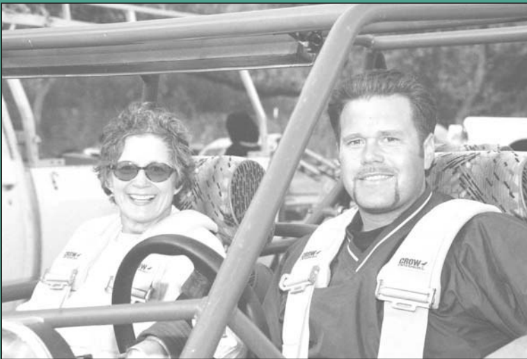
Our various off-road games are fun for the whole family! Come join the fun at the Northern Jamboree & help raise funds for land use projects in your area!

Free 90 Day Membership to Prospective Members