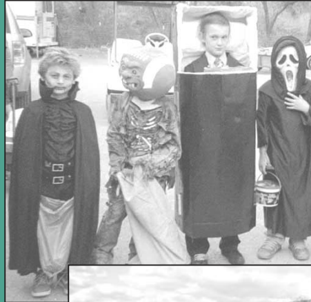
Trick-Or-Treating from camp to camp is a favorite kids activity!