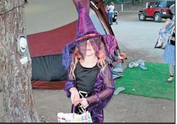
Children and adults dress up for the Northern Jamboree's costume contest, a very popular event

So I want us all to focus on bigger and better things: our CORVA Events. With the summer coming to an end and the deserts cooling off, camping season is getting closer and a great way to get ready is to attend one of our Jamborees. Our Southern Jamboree will be held on October 20th in the