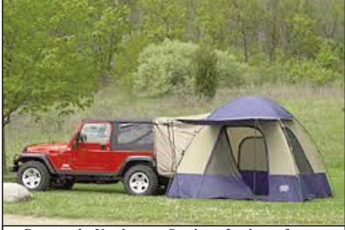
Come to the Northern or Southern Jamboree for your chance to win a versatile Napier tent!

My wife really likes that the SUV tent can be disconnected from the main tent without taking the tent down and that it has a private area for chairs, a cooking area or for extra campers! The truck tent allows my son and I to use the flatbed trailer to give a patio-type arrangement, which also lets us use the canopy from the truck tent! I really like that there is a tent pass-through (using the rear window slide of